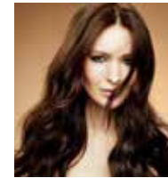
SAHARA Tousled waves with texture create a wind blown look