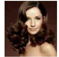
VIENNA A glamorous look with face framing curls