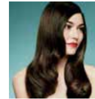
CASABLANCA A sophisticated, sleek look