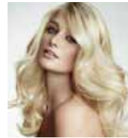
IBIZA Amplified volume with movement and bounce

Discover a new world of blow-dry styling